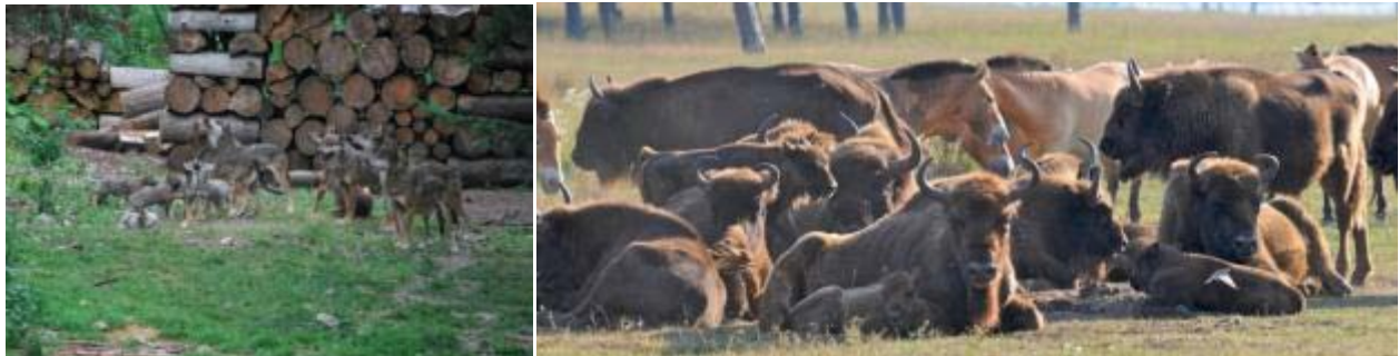
@ Parc alpha – field Haut-thorenc