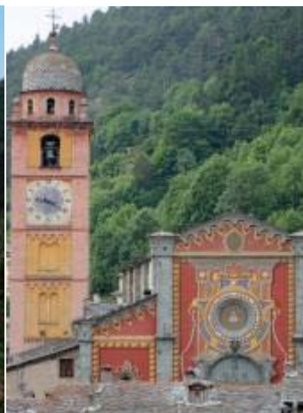
Roya Bévéra Villages