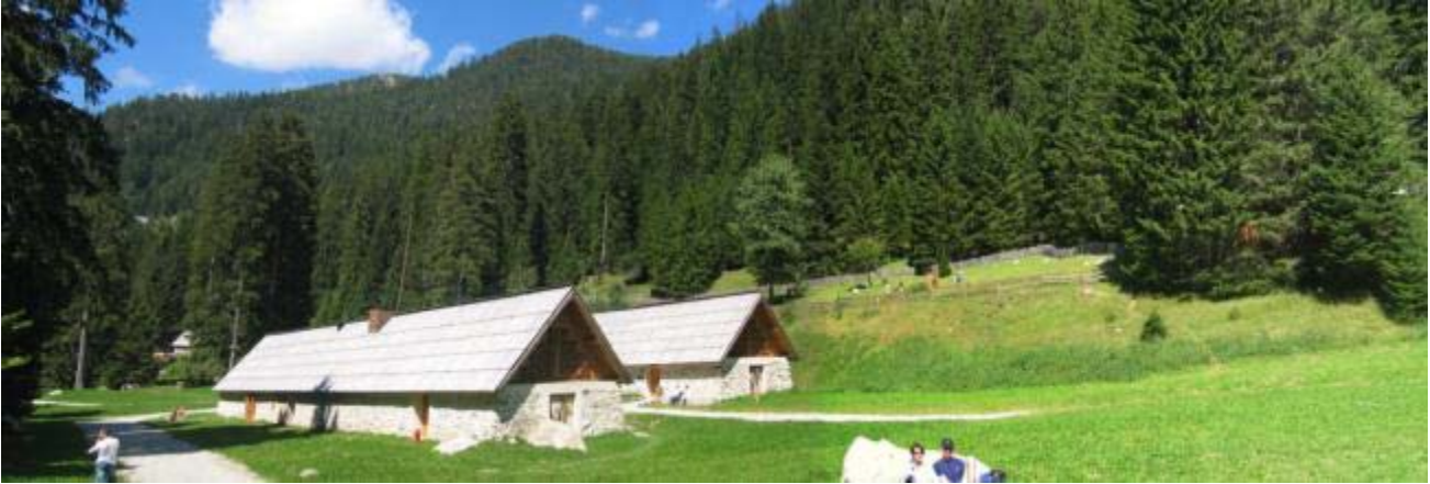
@ Parc alpha – St Martin Vésubie

The wish to tell the whole story of the recent and distant confrontations between man and wolf was the reason for the creation of Alpha, Mercantour Wolf Park. Alpha – the internationally recognised name for the dominant pair in a pack of wolves - is not just a reserve where wolves are held in captivity. It is an animal park located in a magnificent setting, which, with the originality of its scenery, has no equivalent anywhere in the world.