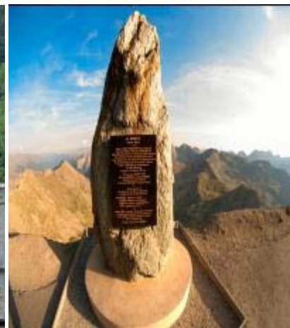
Col de la Bonette